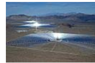
Solar: The Future of Energy? CNBC