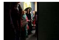
Memphis Elementary drama club presents...