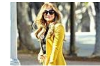
Jennifer Lopez Street Style: 14 Fly Girl Ph... Mommy Noire