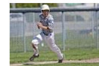
Richmond dominates Allen Park Cabrini